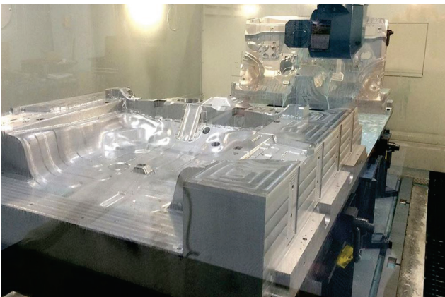
Fig. 1 — Subtractive machining of a geometrically complex aluminum gauging tool for checking automobile polymeric shapes.

Aluminum alloys used to fabricate these components are specially heat treated. These materials are intrinsically sensitive to any process or procedure, such as welding or