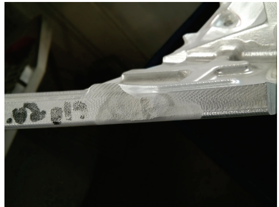
Fig. 5 — Snap-off defect dimensionally repaired with SST cold spray, before (top) and after (bottom).

A local manufacturer of high-precision aluminum gauging fixtures saved thousands of dollars by using the SST cold spray technology to salvage a number of high-value fixtures that were either incorrectly machined or simply worn beyond their useful life. -iTSSe